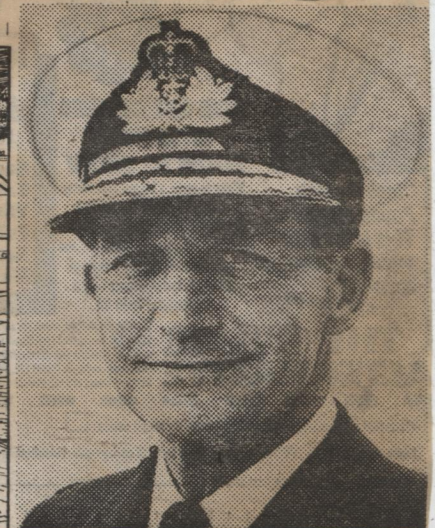
Support — Lord Hill-Norton